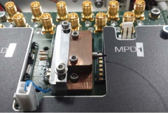
Exemple of butterfly (top) and TOSA (bottom) laser diode